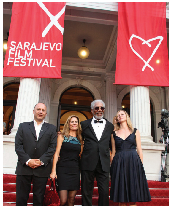
The Sarajevo Film Festival – the first and the largest film festival in the region!