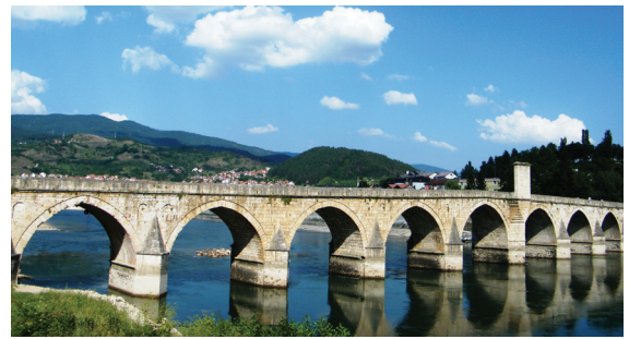
Mehmed Pasa Sokolovic Bridge, Visegrad UNESCO's World Heritage