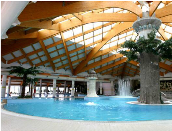
"Ilidža Terme", the hot springs of Sarajevo Investor: Terme Čatez, Slovenia