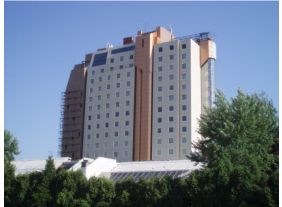
Tuzla Hotel, Tuzla Investor: RAM Invest, Slovenia