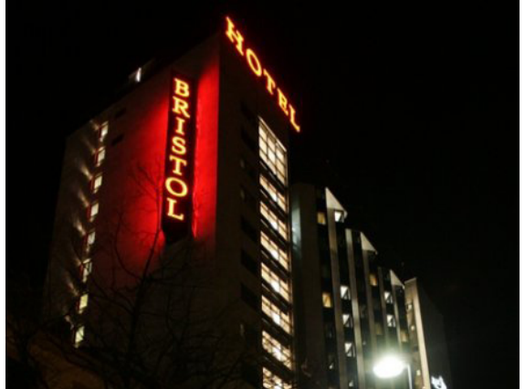
Bristol Hotel, Sarajevo Investor: Shiddi International, Saudi Arabia