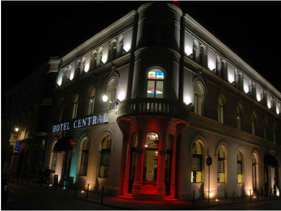
Hotel Central, Sarajevo Investor: Templeville Development, Ireland