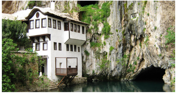
TEKIJA (Dervish monastery) at BLAGAJ, 16th-century