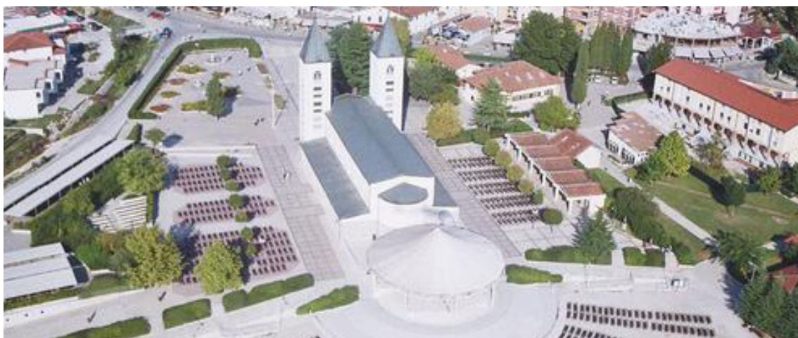
MEDJUGORJE, One of the largest catholic pilgrim sites in the World

Bosnia and Herzegovina is a country of long and rich history, which cultural heritage presents a complex mixture of Mediterranean, Byzantine, Ottoman and Central European influences making the country a unique attraction for cultural and religious tourism. There are a number of towns, memorial of the past time and testimonial of continuity of habitation at these places from antique and medieval periods to present time such are: Mostar, Pocitelj, Banja Luka, Trebinje, Travnik, Bihac, Visegrad, Jajce, etc. As a meeting point of different civilizations and cultures over centuries, most of major religions Judaism, Roman Catholics, Christian Orthodox and Islam exist in harmony in B&H offering a number of sacred places and unique experience to domestic and international visitors. Two important monuments and tourist attractions in the country – Old Bridge in Mostar and Mehmed Pasa Sokolovic Bridge in Visegrad are included at UNESCO World Heritage list.