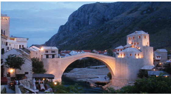
Old Bridge, Mostar UNESCO's World Heritage