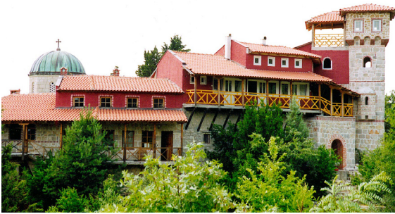
TVRDOS, Serb Orthodox monastery near the city of Trebinje, 15th-century