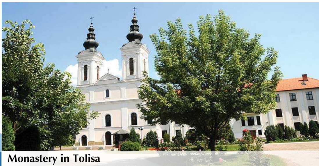
Monastery in Tolisa

It is apparent from the above that Municipality of Orašje is rich in recognized events, which represents a great advantage in the context of tourism and economy development.